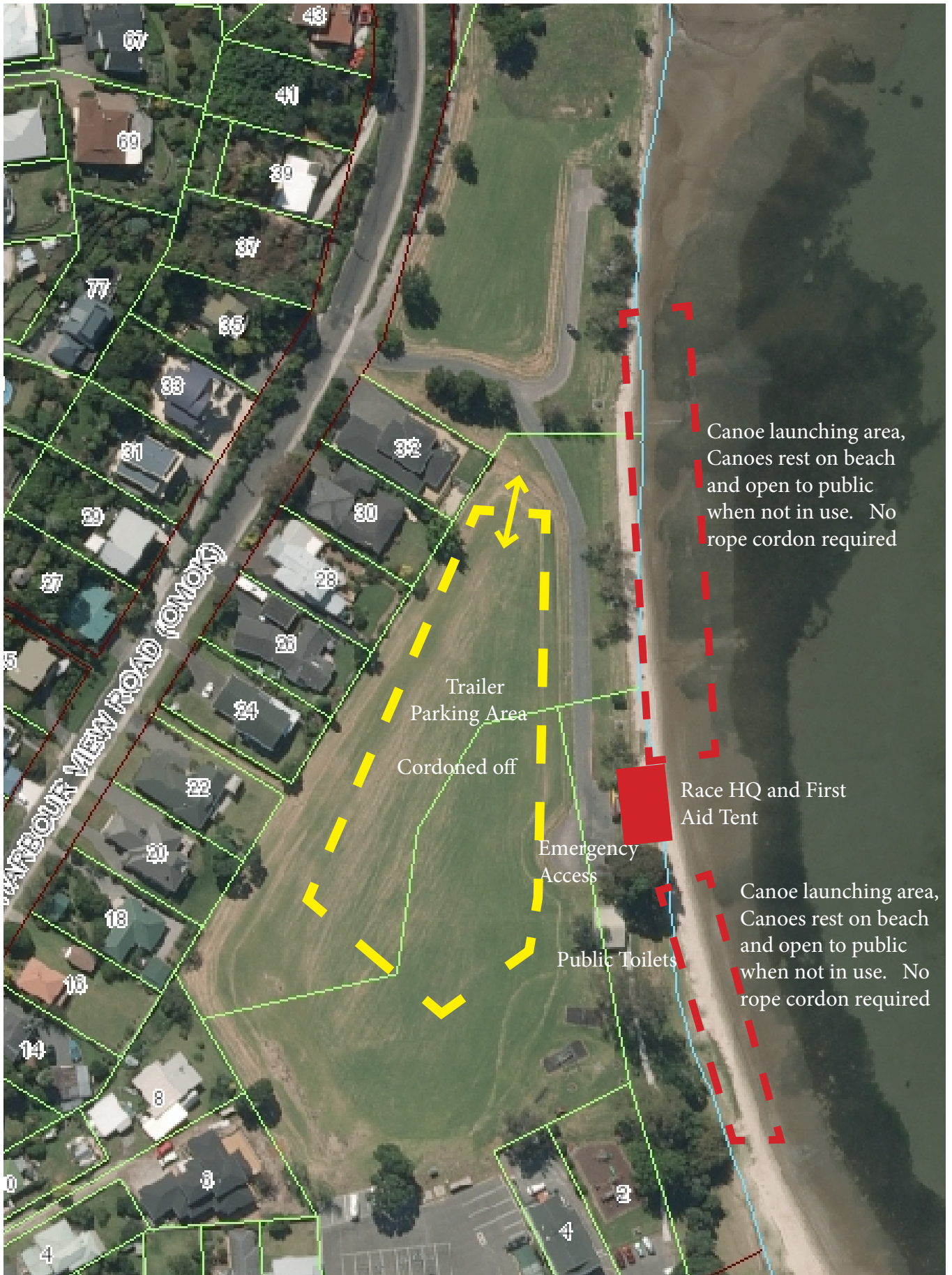
Tauranga Moana Outrigger Canoe Club Omokoroa Dash Outrigger Canoe Event Plan of Event Set Up Area